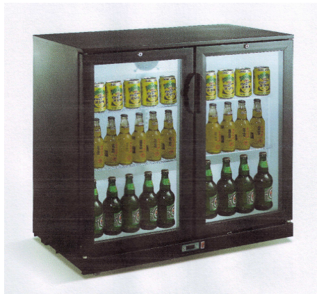
Model MARA 2